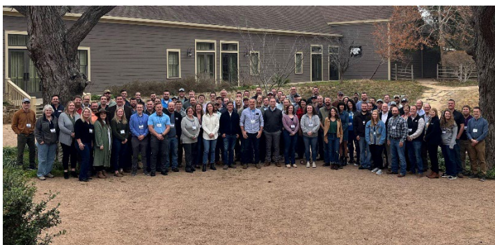
TEPAP 2023 – Unit I

TEPAP is organized into two concurrent, one-week sessions. First time participants will need to enroll in Unit I. Those who have completed Unit I are eligible to enroll in Unit II. If you have completed both Unit I and Unit II, you are invited to enroll in the TEPAP Alumni category. The program fee for Unit I, Unit II, or Alumni is $7,000.