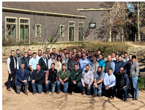
TEPAP 2023 – Unit II

Applications will be accepted starting July 1, 2023, but enrollment is limited! Apply on-line at: https://tepap.tamu.edu Qualified applicants will be selected in order of receipt of application and confirmed based on receipt of payment.